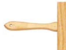
Kalsomine (w/ handle)